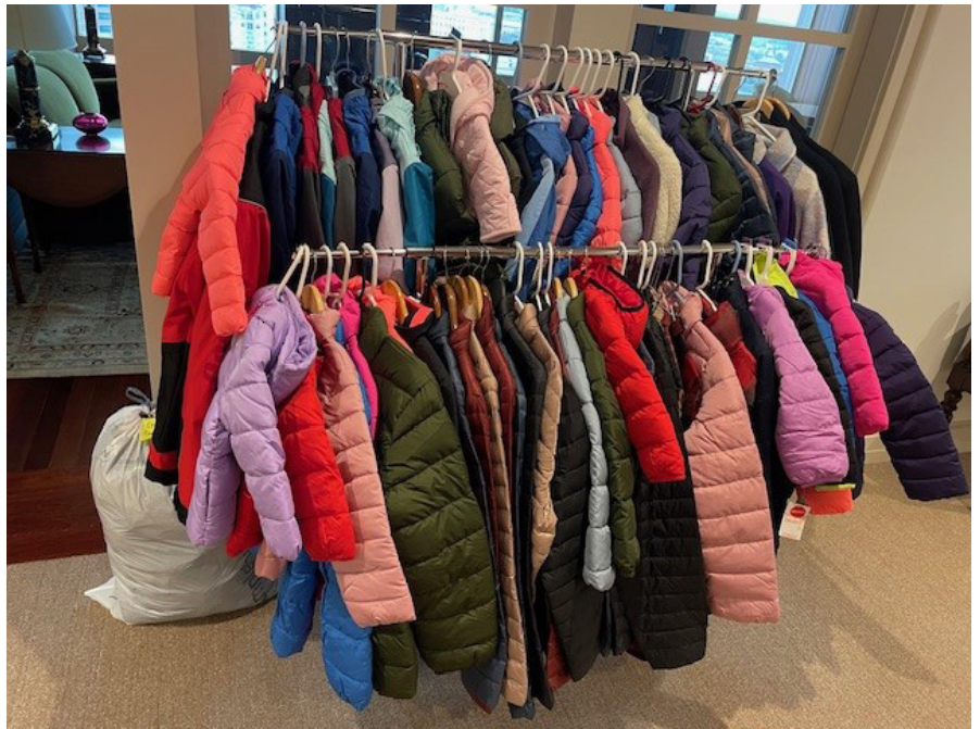
The Providence Center's Donations Committee organized a Winter Coat Drive and distributed coats to 110 TPC clients.