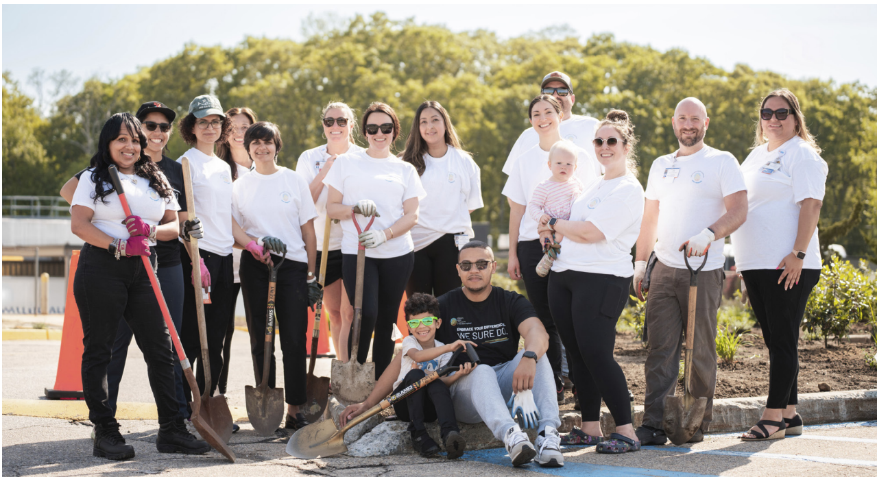
Kent Hospital's Diversity, Equity and Inclusion Council's Kent Clean Up and Planting Event

Under the Affordable Care Act, nonprofit hospitals must complete Community Health Needs Assessments (CHNA) every three (3) years to ensure a continued focus on community health needs. The CHNA identifies health priorities of our communities through data collection and analysis, followed by targeted health improvement initiatives. To support this process, we will implement community engagement strategies and collaborate with community organizations. In addition to the CHNA, we will complete a comprehensive community health improvement plan, which will also be made publicly available.