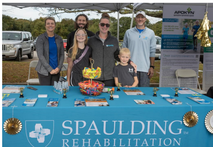
Spaulding Rehabilitation at Kent Hospital Employees at the American Parkinson's Disease Association Optimism Walk

On September 28, 2024, the American Parkinson Disease Association hosted the 2024 Optimism Walk. The Spaulding Rehabilitation of Kent Hospital sponsored the event and took part in the walk. This nationwide movement brings together people to raise awareness and inspire action to end Parkinson's disease. The funds raised directly support local community programs and initiatives aimed at improving the lives of those affected by Parkinson's Disease.