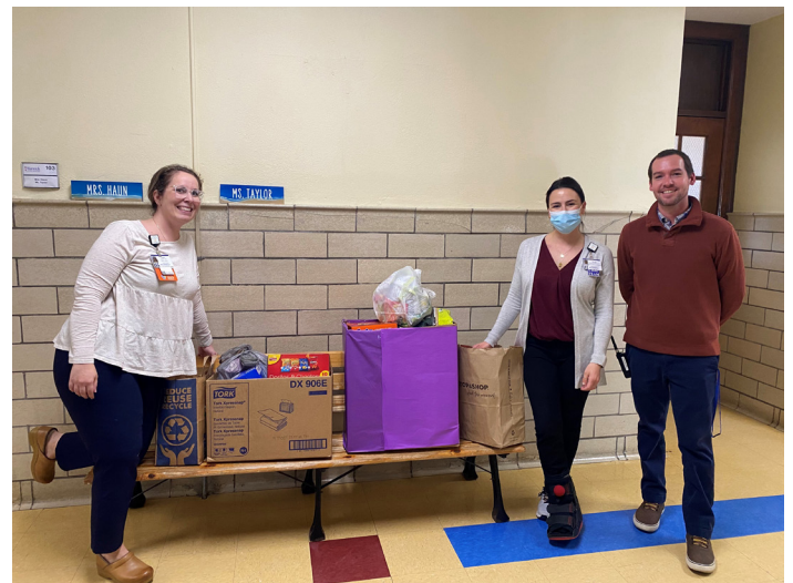
Kent Hospital's Diversity, Equity and Inclusion Council donated 728 pounds of snacks and nonperishable foods at West Bay Community Action Program, 3 boxes to Lippitt Elementary, and 3 boxes to Oakland Beach Elementary.