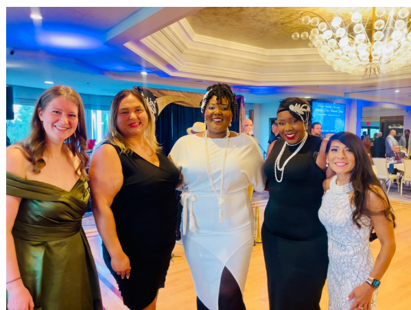
Care New England team members at TIDES Family Services' Roaring 20s Annual Gala

Care New England is committed to training the next generation of caregivers while delivering excellent clinical care to southern New England communities. Through partnerships with The Warren Alpert Medical School of Brown University and other medical programs, medical students gain hands-on experience and mentorship in patient care, research, and education. In 2022, Care New England invested $39.2 million to support education, ensuring quality healthcare now and for future generations.