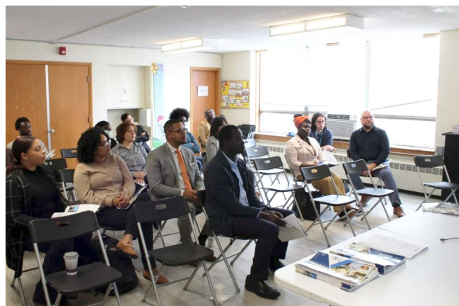
Care New England Employees Attend the Refugee Dream Center's Needs Assessment Report Presentation

Integra and Care New England supported the Refugee Dream Center's Needs Assessment Survey conducted from January to June 2024 which gathered responses from 50 refugees to understand healthcare access and equity issues. Respondents came from various countries, with the majority from Senegal and Haiti. A staff member from the Refugee Dream Center state, "We extend our heartfelt gratitude to Integra/Care New England for their generous financial support, which has made this vital project possible." To view the report, click here or go to www.refugeedreamcenter.org/about-us/ .