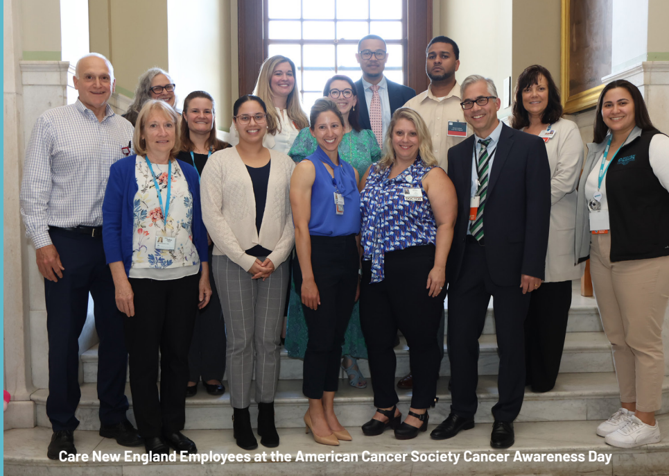
Care New England Employees at the American Cancer Society Cancer Awareness Day