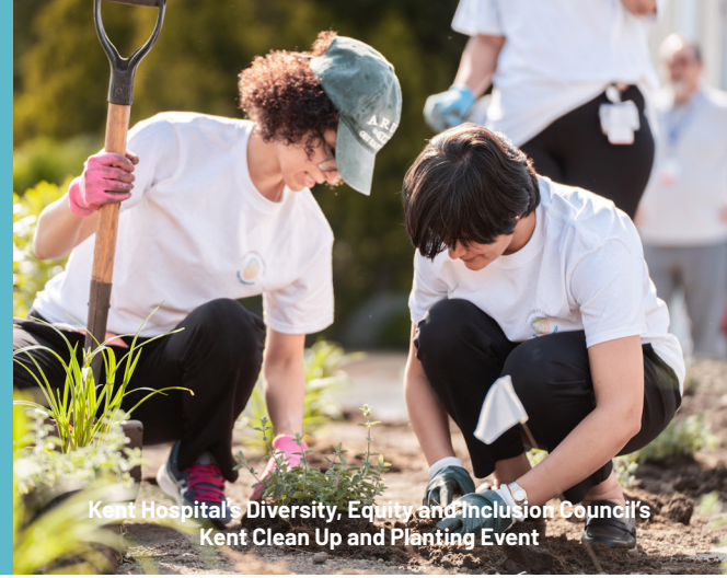
Kent Hospital's Diversity, Equity and Inclusion Council's Kent Clean Up and Planting Event

Care New England is proud to contribute to community wellness through a holistic approach. The following community benefit activities represent our contributions from 2022, the most recent fiscal year for which data are available.